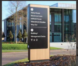
Retail Estate Signage