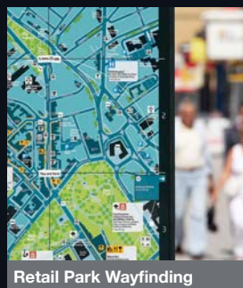
Retail Park Wayfinding