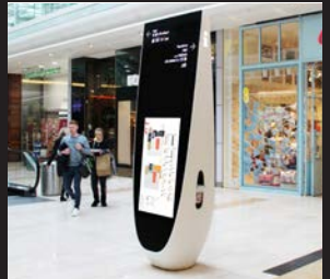
Digital Interactive Mapping