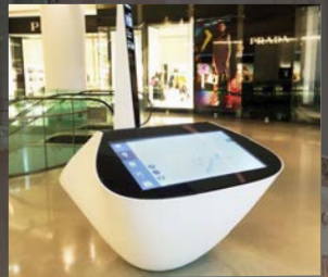
Digital Directory Signage