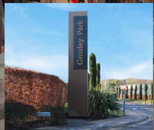
Retail Park Entrance Signage